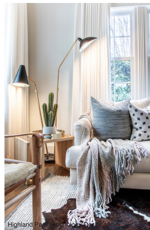
Highland Park Interiors

teriors that incorporate more color, texture, and character. Clearly-defined styles (e.g., mid-century modern, industrial, modern farmhouse) are being replaced by a curated look, with furnishings, fixtures, and accessories that appear to have been collected over time. 3 This trend has extended to the kitchen, where atmosphere has become