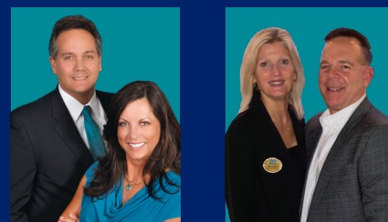
VB Real Estate Dream Team