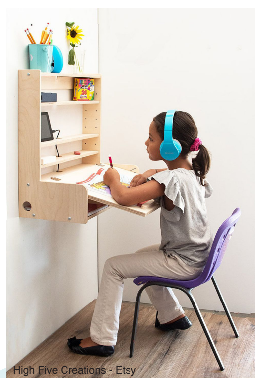
High Five Creations - Etsy

The necessity of a home office space is also here to stay. But what if you don't have a dedicated room? Alternative workspaces have become increasingly popular. In fact, one of the biggest trends on Pinterest this year is the "cloffice"—essentially a spare closet turned home office. Searches for "home library design" and "bookshelf room divider" are on the rise, as well.