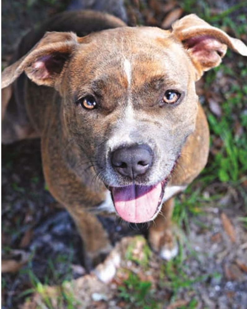
Sadie – American Staffordshire Terrier

What do you like best about your pet? They are both sensitive loving dogs and we no longer need alarm clocks. They wake us with cute faces and wagging tails at our bedside.