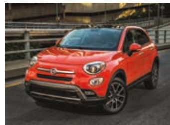
Fiat’s 500X Trekking Plus —A Tiger on the Fashion Runway in a Fast-Growing Segment

base-model couple to the F-Type R AWD that we test drove. This $106K version comes in coupe or convertible equipped with 5-liter supercharged V8 engine and all-wheel drive 8-speed automatic transmission. 550 hp and 502 ft lbs of torque launches this kitten from zero to 60 in 3.9 seconds. Torque-vectoring technology keeps it sure and stable through the corners. It too has driving mode options to give it multi personalities. Any chance he gets, Dad will activate the active exhaust system for that sound he relishes.