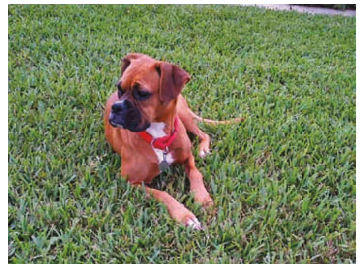
Chloe - Boxer

part of the pit bull family and was in quarantine when we volunteered to foster her and later adopted her. Chloe was adopted a year before Sadie joined the family. They have been inseparable, playful, loving sisters since day one.