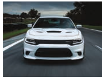
Dodge Hellcat Charger —This Cat Wins Every Time