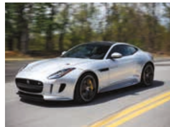
Jag F-Type R is One Fine Feline

explosive acceleration. Behave Dad, or Mom will hide the red key! (Hellcat comes with two keys: A red fob gives access to the full 707 hp, a black one leashes back the kitty to 500hp.)